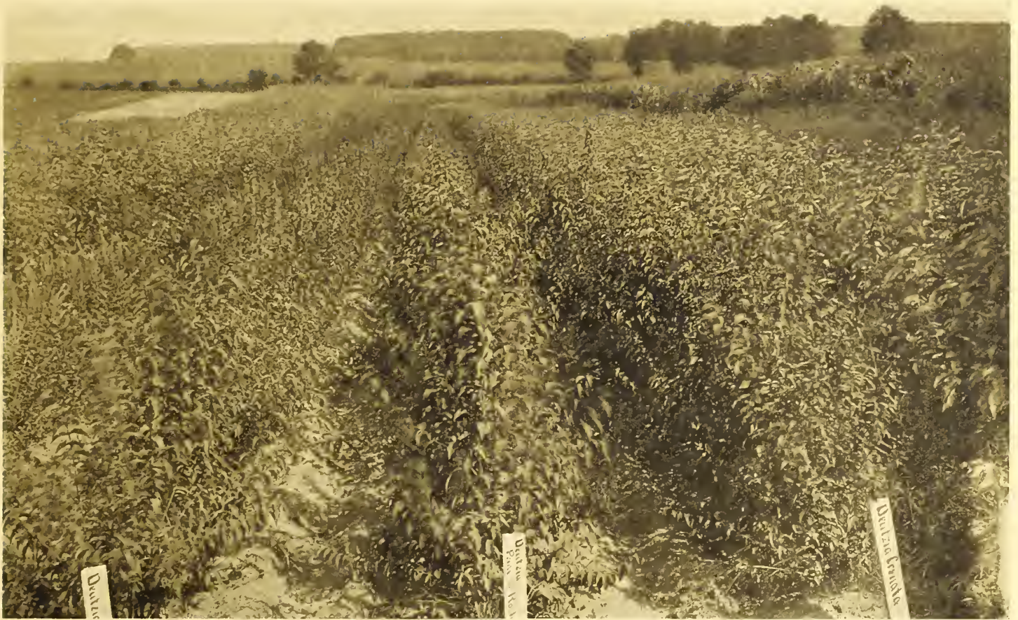
Our Two Year Deutzias